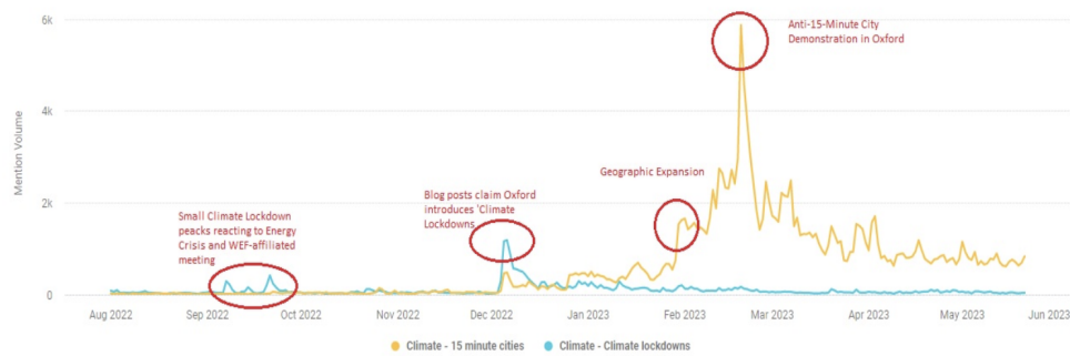
Twitter references to '15-minute cities' and 'climate lockdowns' respectively from August 2022 to May 2023